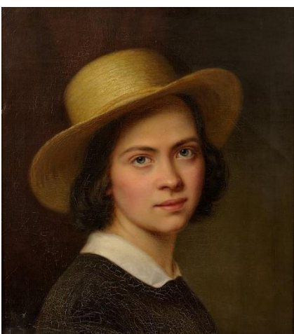
Left: self portrait of Julie Hagen-Schwartz

Johann Köler and Julie Hagen-Schwartz have etched their names into the annals of Estonian art history, becoming iconic figures. The film is a fictional account of their meeting, a Gothic story of forbidden love and mystery in the atmosphere of dread and foreboding. Commemorating the bicentennial of Julie Hagen's birth in 2024 and the upcoming celebration of Johann Köler's bicentenary in 2026, their artistic legacy remains profound. We aspire to unveil this film to the world on the anniversary of Johann Köler's birth, a fitting tribute to these legendary figures and their enduring impact on world art.