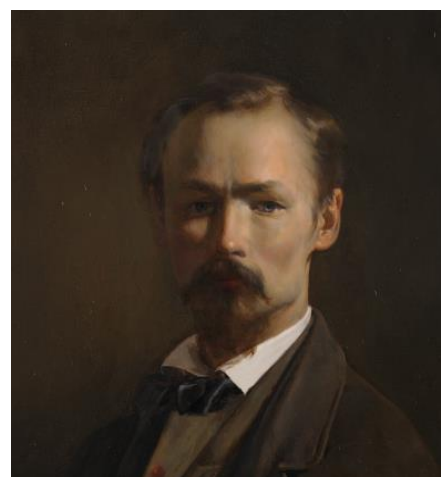
Right: self portrait of Johann Köler